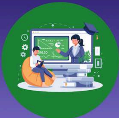
ONLINE MODE LEARNING FROM HOME