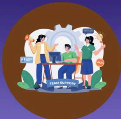
DEDICATED STUDENT SUPPORT TEAM