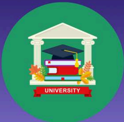
GOVT. UNIVERSITY CERTIFICATE